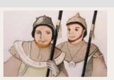
The guards, Marcellus and Bernardo, are soldiers who guard the castle and act as watchmen on the castle ramparts.