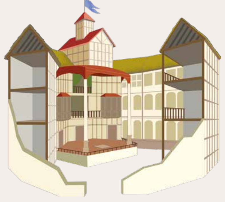
An Elizabethan theatre building